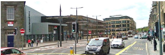
Edinburgh Haymarket Interchange: The Tram stop is on the central island; Airport bus stop is on the RHS

Stirling is frequently served by trains from Edinburgh and Glasgow, and by regular LNER trains from London changing at Edinburgh Waverley (for a Dunblane train). Train tickets from London Kings Cross to Stirling can start from as little as £26.50 Standard Class if booked well in advance. Flying into Edinburgh Airport will require a Tram or Airlink 100 Bus journey to Haymarket Station from where the frequent train service runs to Dunblane via Stirling.