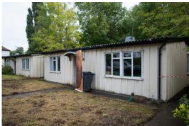
Wake Green Road Prefabs

The Grade II listed Phoenix prefab bungalows in Wake Green Road were designed and manufactured by John Laing, McAlpine and Henry Boot, as part of a consignment of 2,428 prefabs supplied to the Ministry of Works under the Temporary Housing Programme. These temporary homes were only expected to be in use for ten years but 70 years on they are still in use. There are no other known surviving Phoenix prefabs still lived in which makes these extra special.